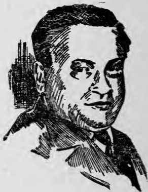
E. HALDEMAN-JULIUS Editor LITTLE BLUE BOOK